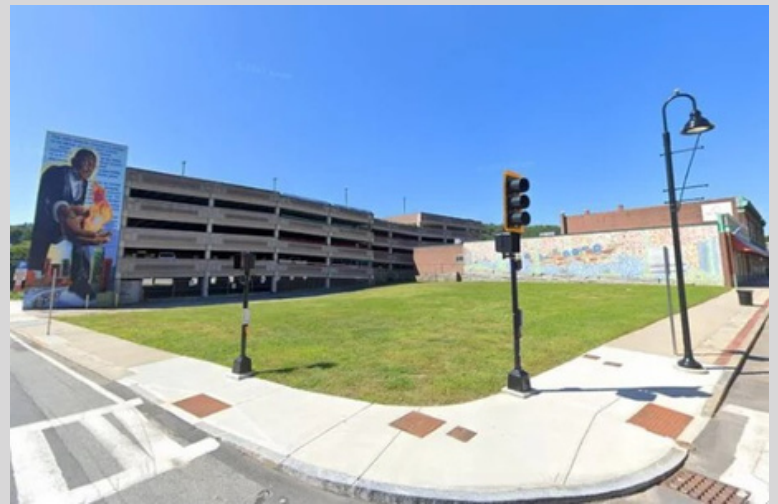
520 Main Street lot ready for redevelopment

As we all wait in anticipation of what may be submitted, what do you envision at 520 Main Street? For more information regarding the RFP, please visit fitchburgredevelopment.com and click on the ribbon at the top of the home page.