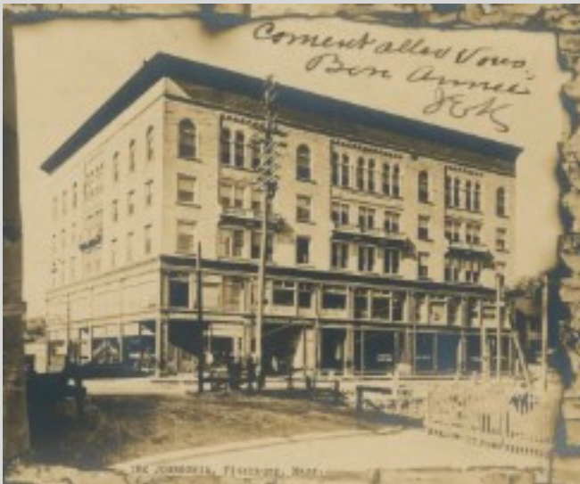
Historic photo of the Johnsonia Hotel